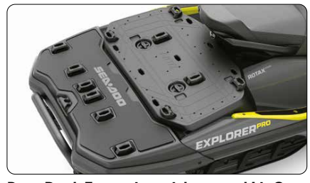
Rear Deck Extension with second LinQ attachment system

An innovative hull that sets the benchmark for rough water handling, stability, and offshore performance.