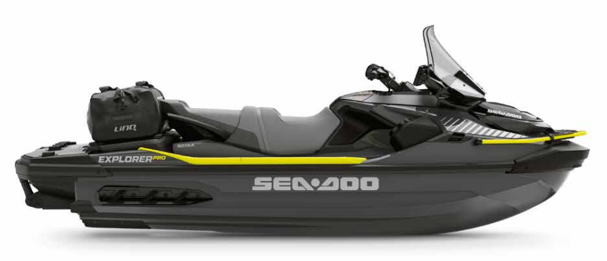
NEW Iceland Grey