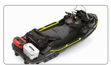
Extended Riding Comfort

An industry-first that reduces fatigue and noise associated with prolonged wind pressure whilst also protecting against splashing and salt water exposure when riding offshore.