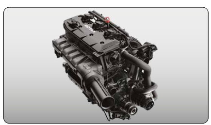
Rotax® 1630 ACE™ – 170 Engine

Keep extra gear dry and easily accessible with this 100L bag. This exclusive LinQ compatible accessory is waterproof, functional and portable. It can be stacked on the LinQ plate/LinQ accessories or carried as a backpack.