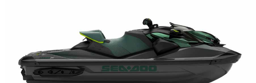
NEW Racing Green